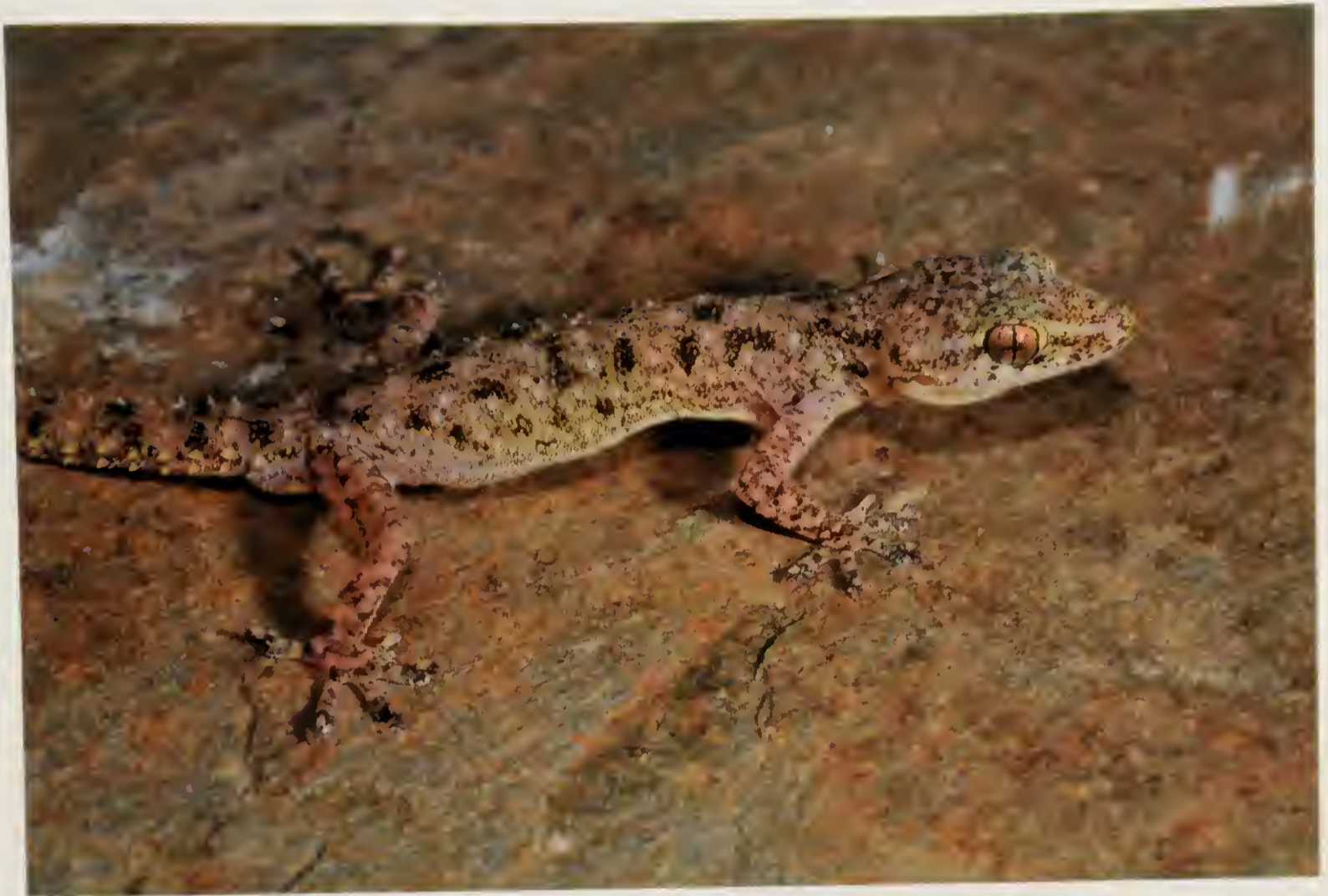
Figure 4. Hemidactylus malcolmsmithi in life (CES/11/050).

males, Kangra-Jwalamukhi Road, Himachal Pradesh ( 32^{\circ}1'10.92''\text{N} , 76^{\circ}14'43.44''\text{E} ); CES11065, Sujampur, adult male, Himachal Pradesh ( 31^{\circ}50'14.2794''\text{N} , 76^{\circ}31'13.7994''\text{E} ); CES11070, adult female, near Lunj, Himachal Pradesh ( 32^{\circ}6'39.96''\text{N} , 76^{\circ}9'40.3194''\text{E} ); CES11072, adult male, Chamba, Himachal Pradesh ( 32^{\circ}28'35.7594''\text{N} , 76^{\circ}12'38.88''\text{E} ); CES11073, adult male, Reasi, Jammu ( 33^{\circ}4'41.8794''\text{N} , 74^{\circ}49'52.6794''\text{E} ). All localities in India.